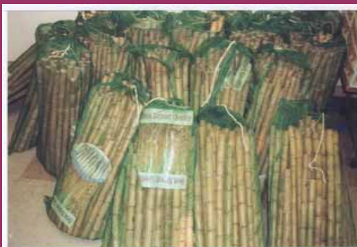
Picture of the sugar cane drug containers

All three men were charged with offences relating to the importation of class A drugs into the UK, and at Isleworth Crown Court they each received 15 year sentences.