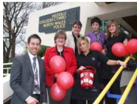
The photograph shows representatives from the force's People Services Group and the canteen at Force Headquarters, Colwyn Bay.

"It's great to know that the money goes towards good causes in our force area, as well as across Africa."